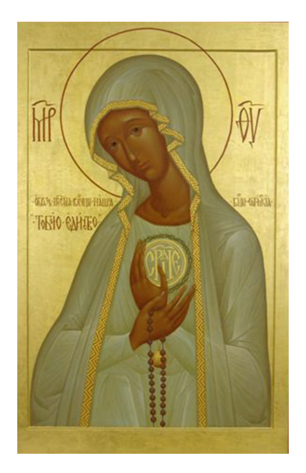
NOVENA TO THE IMMACULATE HEART OF MARY